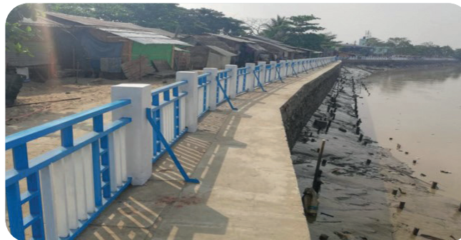
Flood protection by retaining wall in Dagon Myothit (North) Township