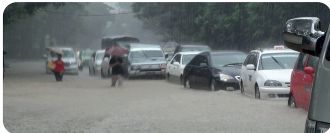
Heavy rain event in Yangon